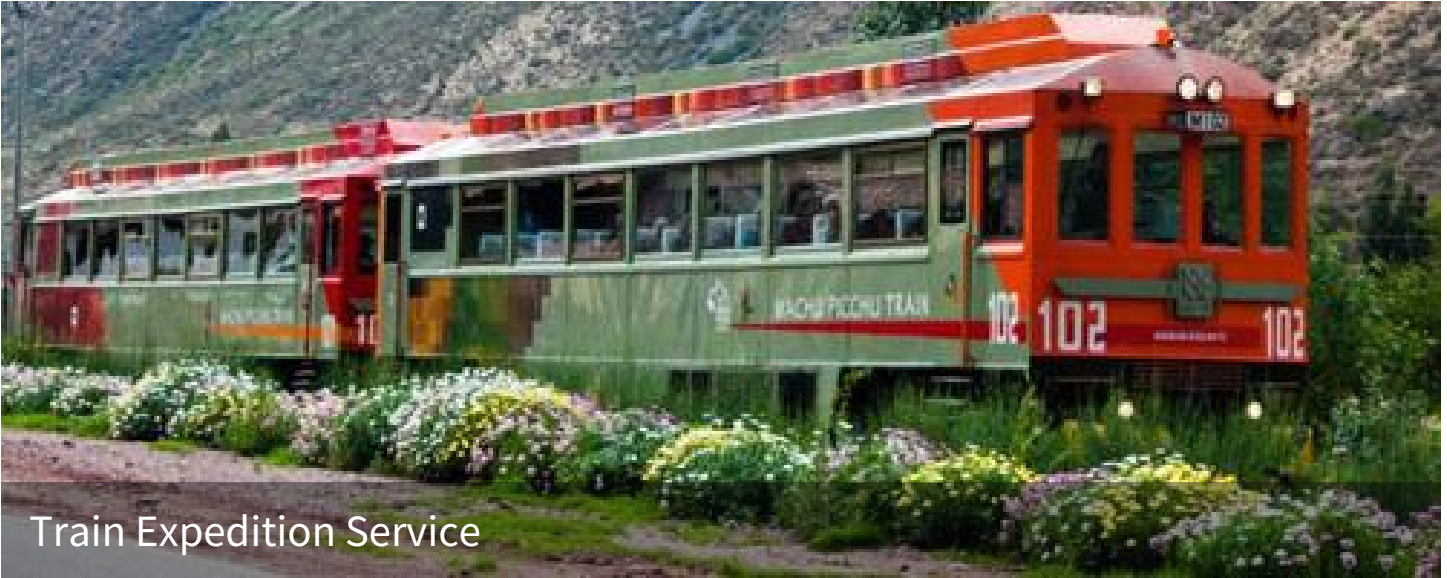
Train Expedition Service