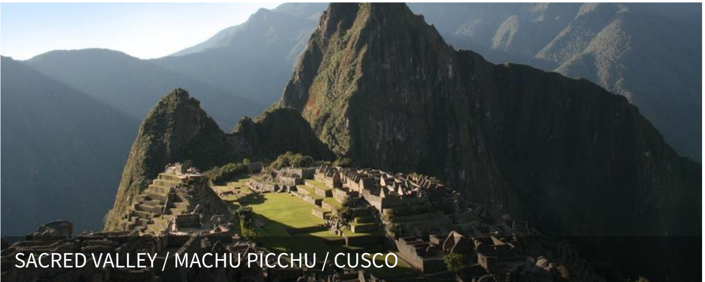
SACRED VALLEY / MACHU PICCHU / CUSCO